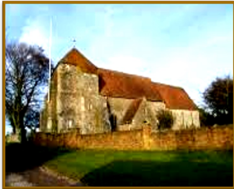
ST. MARY'S, UDIMORE