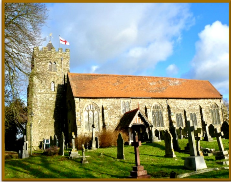
ST. GEORGE'S, BREDE